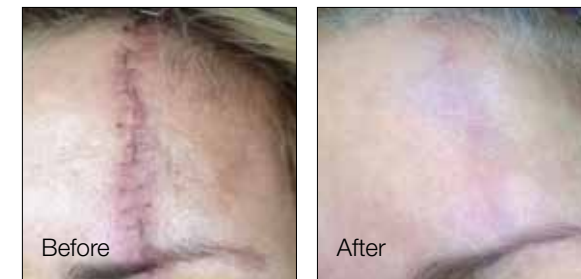
Results after 3 treatments