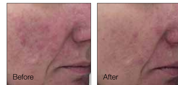
Results after 1 treatment