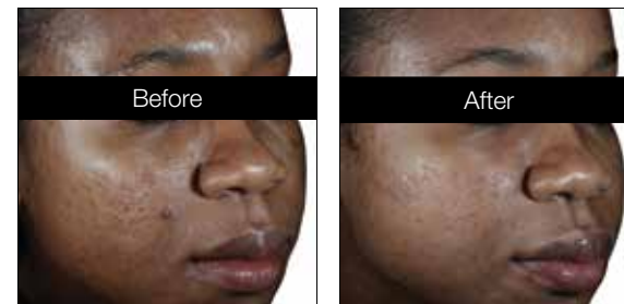
Results after 3 treatments