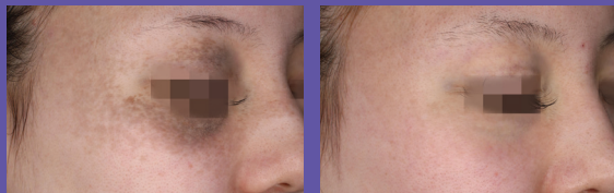
Before & After 3 Treatments