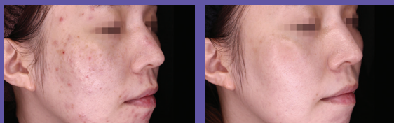
Before & After 3 Treatments

Ask your Clinical Provider today if PicoSure Pro treatments are right for you.